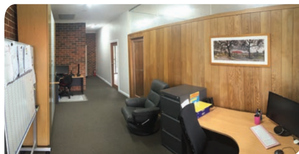
Ergo's Australian Office in Penrith.