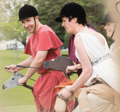
Scott finds a whole new meaning for the term 'horseplay'.