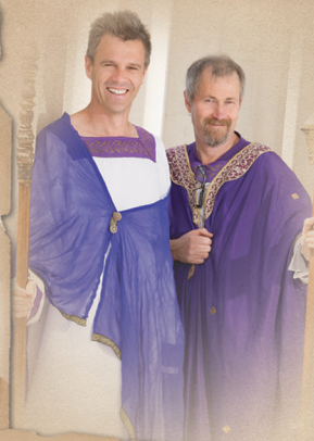
Both hands in plain view, Nige!