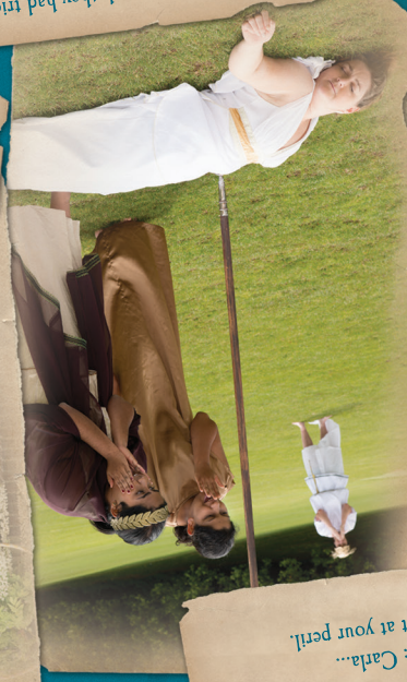
Above: Though they had tried hard, the finance manager still seemed to be breathing.