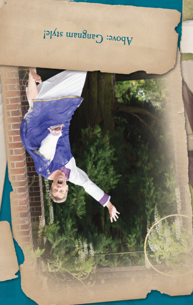
Above: Gangnam style!